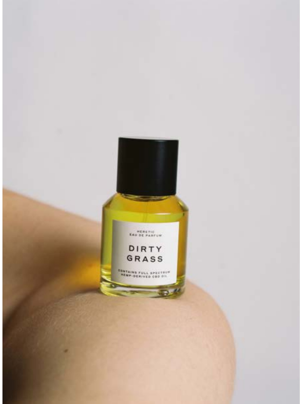
Heretic - Dirty Grass