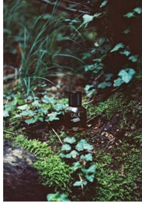
Bravanariz - Bosc

Thanks to its scents Bravanariz gives voice to Nature, it picks up the perfect notes of forests, able to influence and change the soul of the ones who are listening to them. The quintessence of vegetal life, in order to speak the plant language.