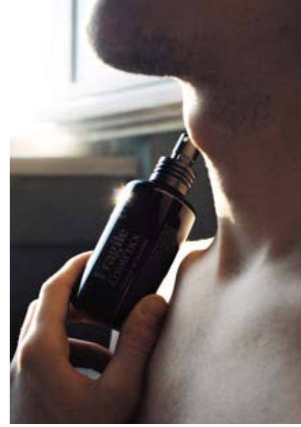
Fragile - Glow