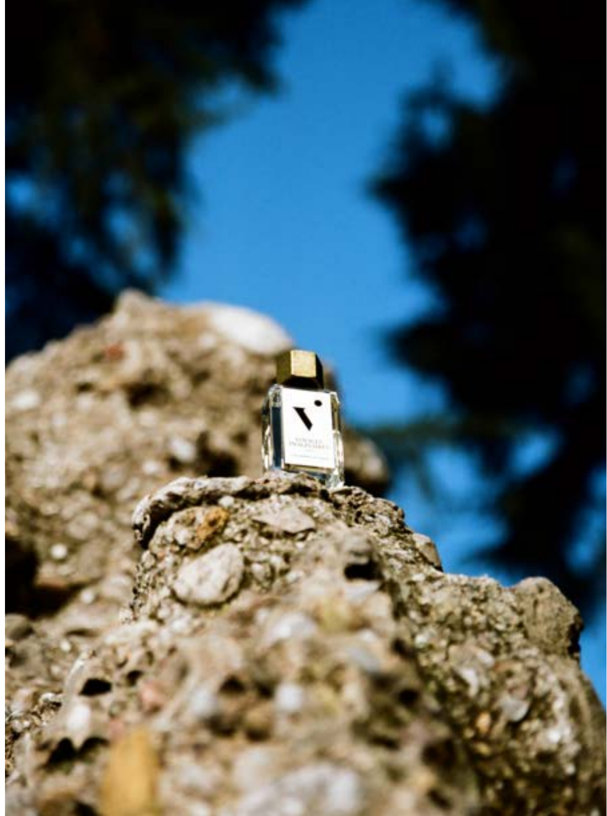
Voyages Imaginaires - Tea & Rock'n roll