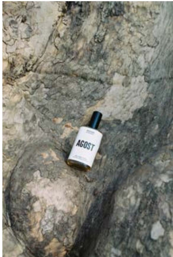
Bravanariz - Agost