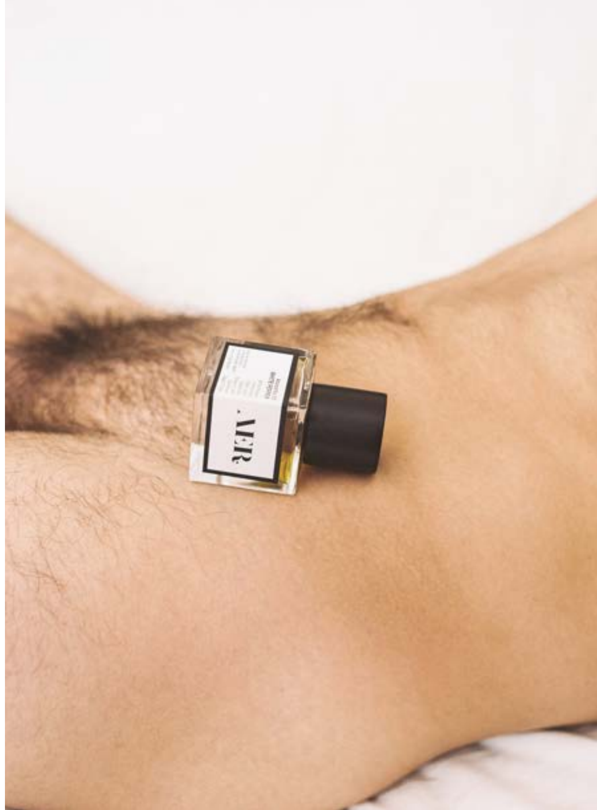
Aer - White pepper