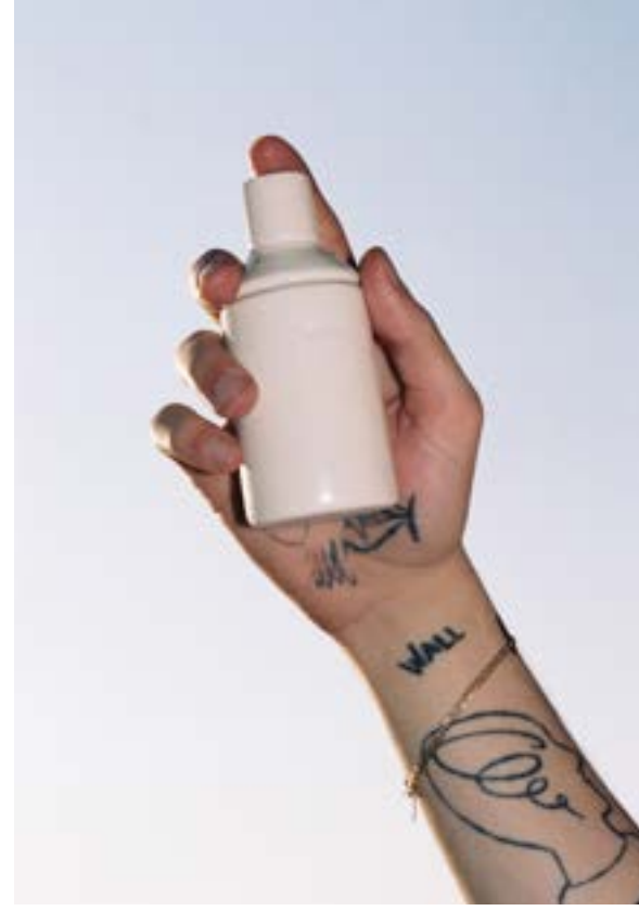
Saint d'ici - A fern

Saint d'Ici is a botanical perfumery based in Johannesburg, South Africa.