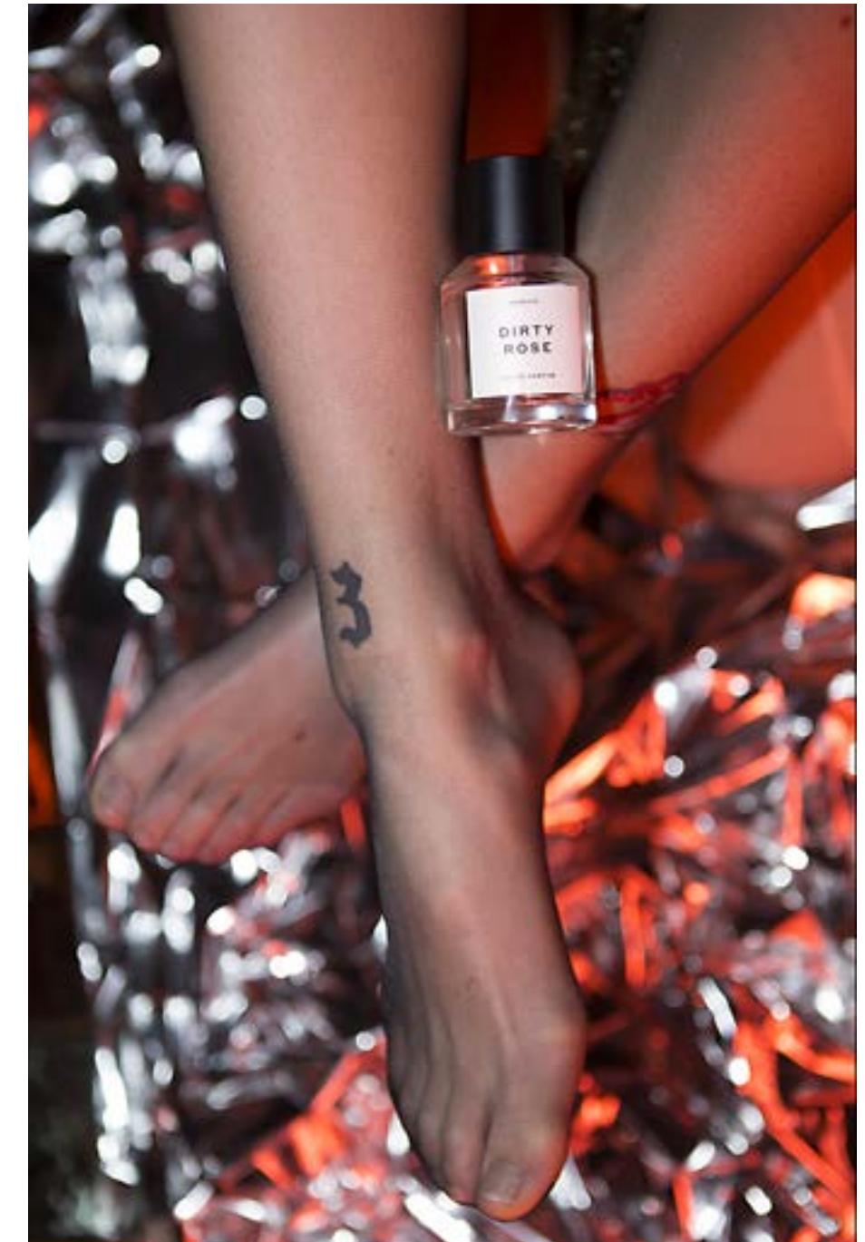
Heretic - Dirty Rose