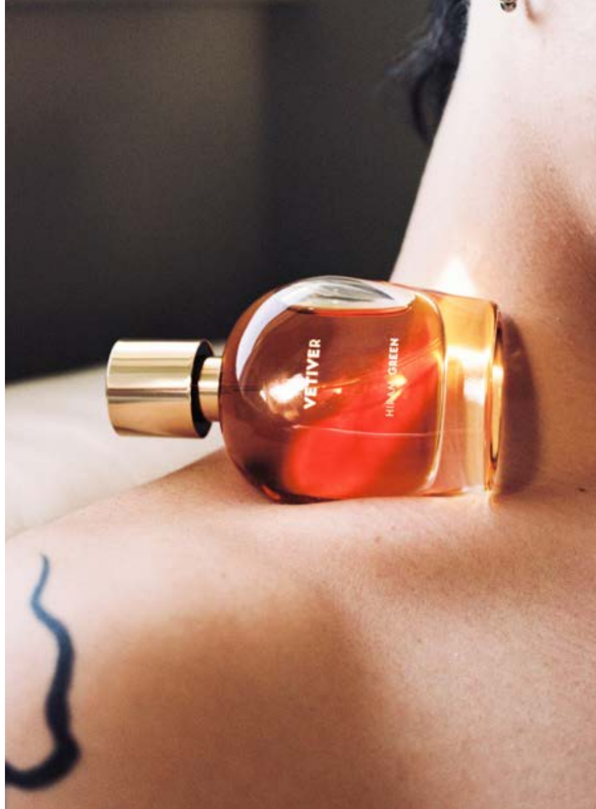
Hiram Green - Vetiver