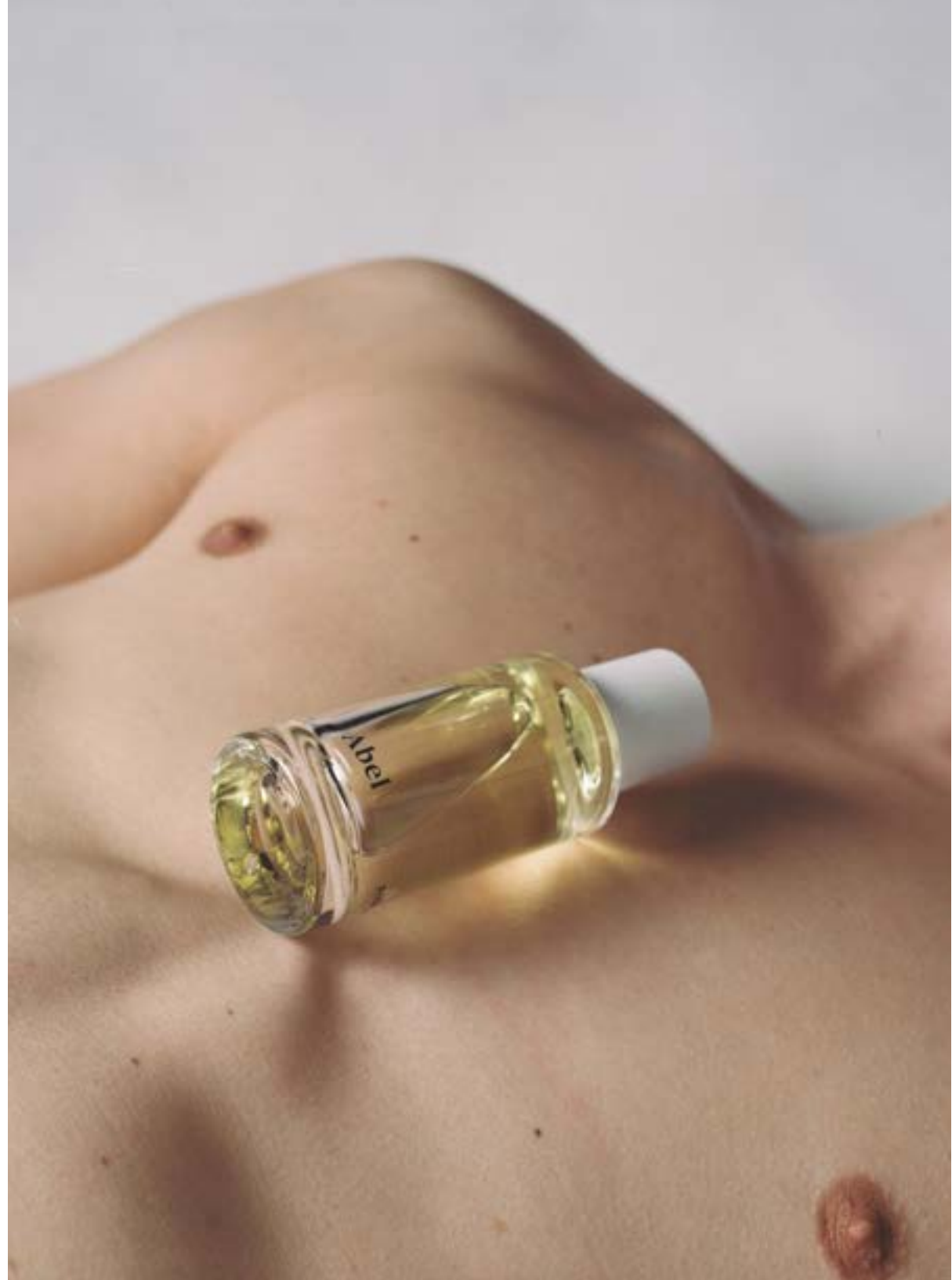
Abel - Pink Iris