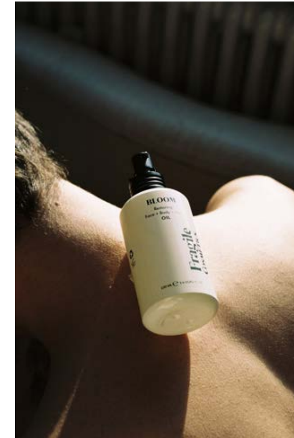
Fragile - Bloom