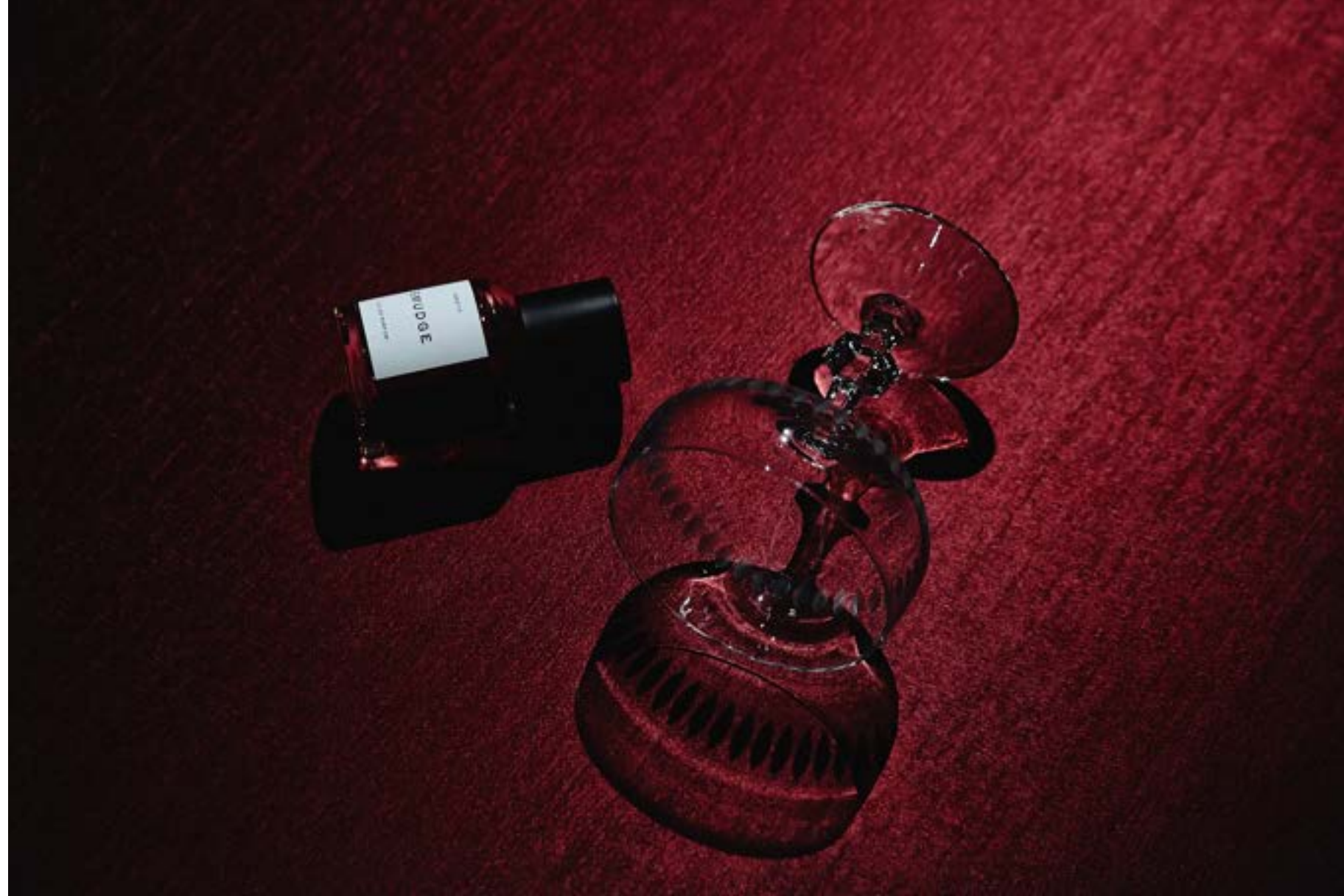
Heretic - Smudge