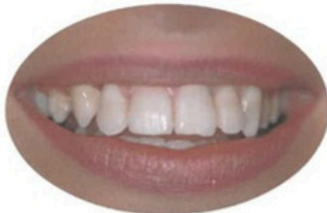
caso n. 2